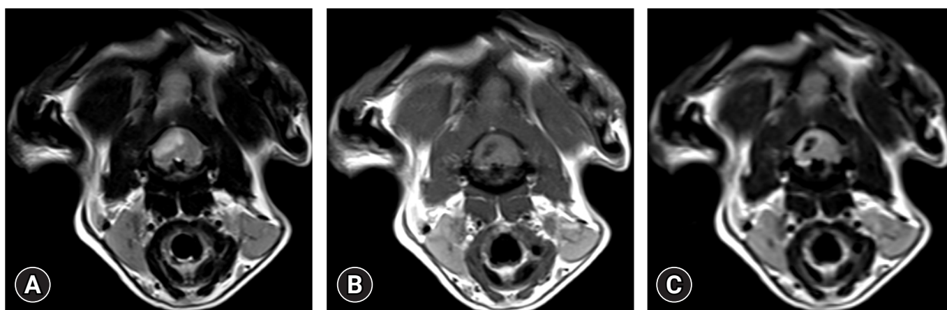
Fig. 2. Transverse T2-weighted (A), T1-weighted (B), and fluid-attenuated inversion recovery (FLAIR) (C) images of the medulla oblongata on magnetic resonance imaging (MRI) in a 9-year-old intact male Maltese (A–C). Note that the bulbous-shaped syrinx in the medulla oblongata, and similar signal intensity to cerebrospinal fluid (hyperintense in T2-weighted image, and hypointense in T1-weighted and FLAIR images).